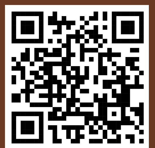
Scan for Registration