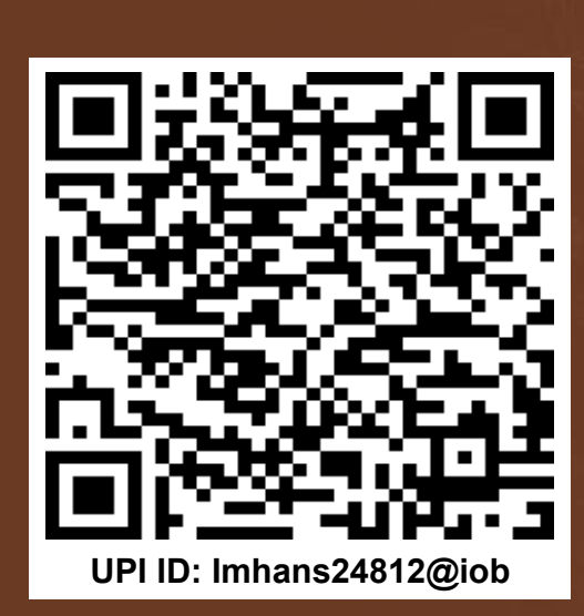
Scan for Payment